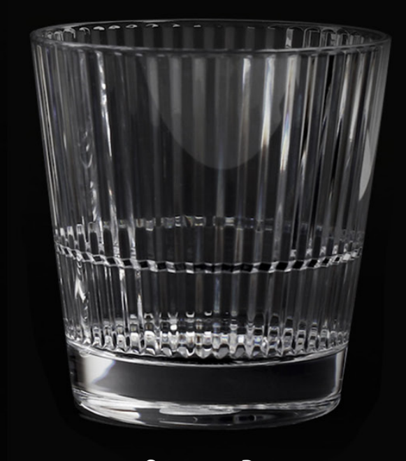
Stripe 355 R

"We are really surprised by the quality of your products."