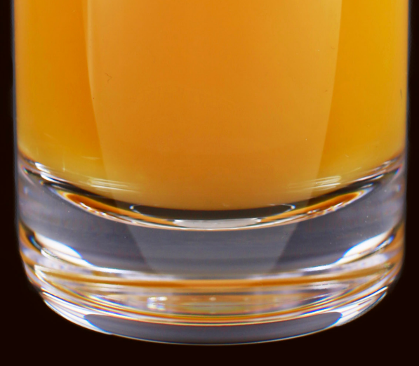
Falsterbo Longdrink 36 cl

Our glasses look and feel just like real glasses. They have crystal clear transparency and are almost impossible to distinguish from real glass. You have probably not experienced this type of quality in polycarbonate glasses before. This opens up to new opportunities, since the glasses can be used in more areas of the hotel where the feeling of luxury is important.